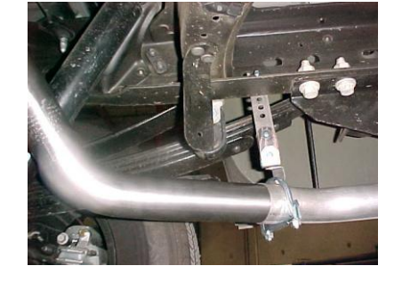
INSTALL PASSENGER SIDE OVERAXLE PIPE #C INTO MUFLER 1 ½" TO 2". USE CLAMP # I TO SECURE. DO NOT TIGHTEN. ROTATE UNTIL PIPE TOUCHES HANGER. USE CLAMP #I TO HOLD PIPE TO HANGER. DO NOT TIGHTEN.

NEXT INSTALL BAND CLAMP #G. SLIDE IT OVER THE MUFFLER. THEN INSTALL HANGERS INTO THE RUBBER GROMMETS LOCATED ABOVE THE MUFFLER OUTLET. USE BOLT KIT # K TO SECURE. DO NOT TIGHTEN.