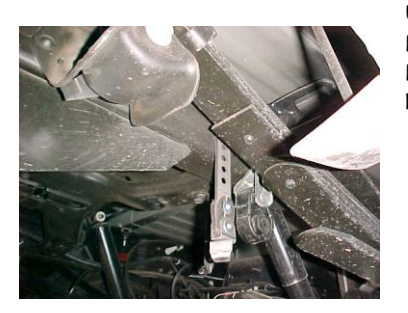
NEXT INSTALL DRIVERS SIDE OVERAXLE PIPE #D INTO MUFFLER 1 ½" TO 2". USE CLAMP #I TO SECURE PIPE TO MUFFLER. DO NOT TIGHTEN. ROTATE PIPE UNTIL IT TOUCHES HANGER. USE CLAMP #I TO HOLD PIPE TO HANGER DO NOT TIGHTEN.